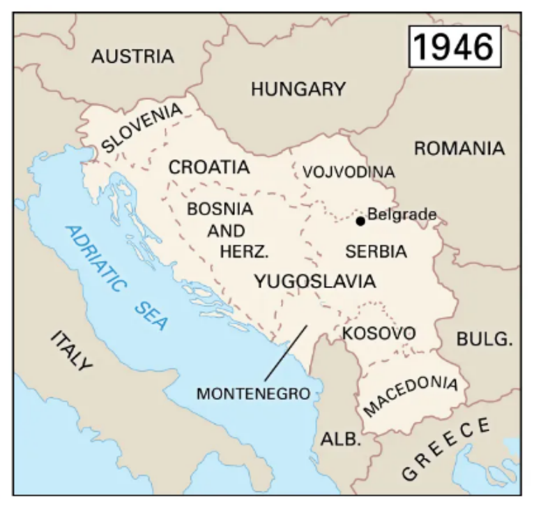
Figure 2. The geography of the area in 1946.

World War II further exacerbated these tensions. The conflict saw the brutal occupation of the region by Axis powers and the rise of a resistance movement led by Josip Broz Tito. Tito's Partisans, a multi-ethnic resistance group, emerged victorious and established the Socialist Federal Republic of Yugoslavia. Tito's authoritarian but charismatic leadership managed to suppress nationalist sentiments and maintain a semblance of unity among the diverse ethnic groups.